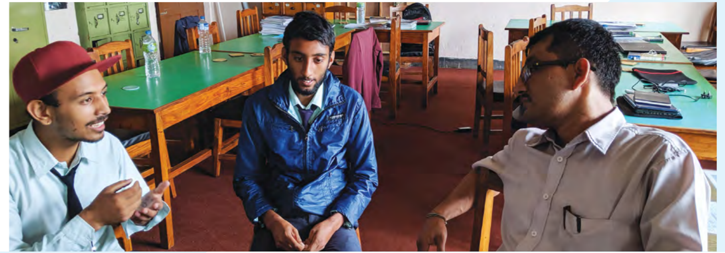
Faculty of Science

ES was introduced in Khwopa College in the year 2058 in the Bachelors Level and in Masters Level in the year 2061 BS. Since the date of establishment, this college has provided the updated knowledge to cater the needs of the generation. Encouraged and motivated to guard their mother earth, students from far and wide register their names for admission and quench their thirst of sharp knowledge of range of subjects of Environmental Science.