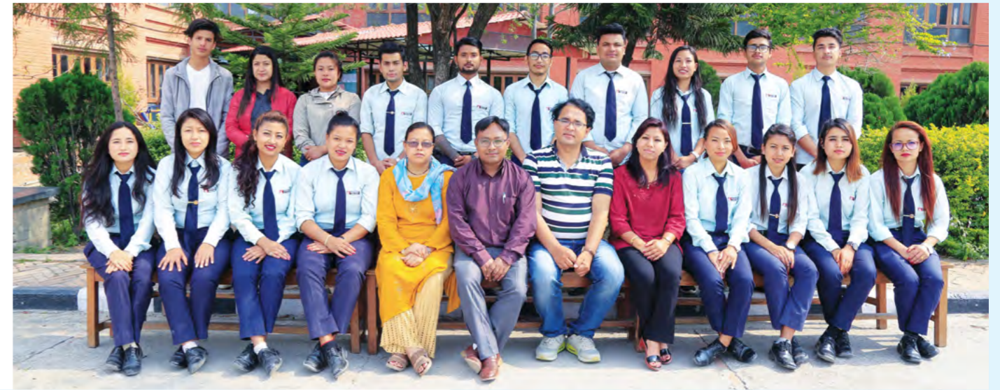
Faculty of Humanities & Social Sciences