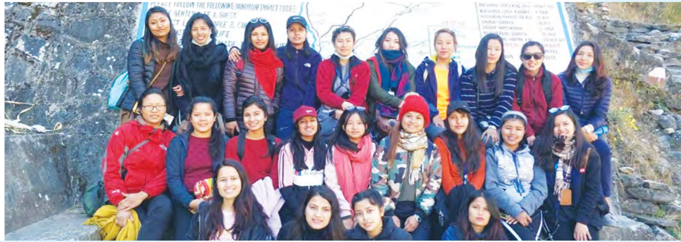
Faculty of Science