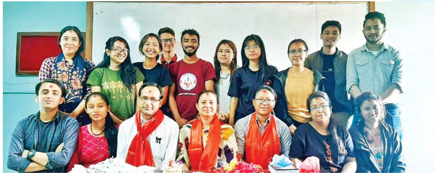
Faculty of Science