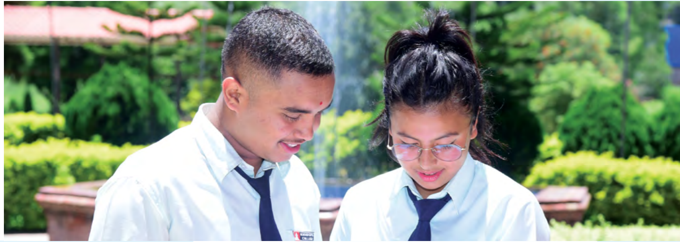
Faculty of Management