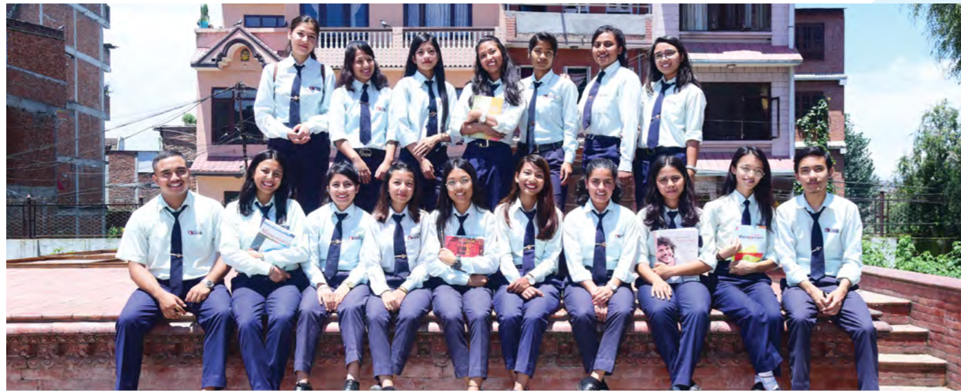
Faculty of Humanities & Social Sciences